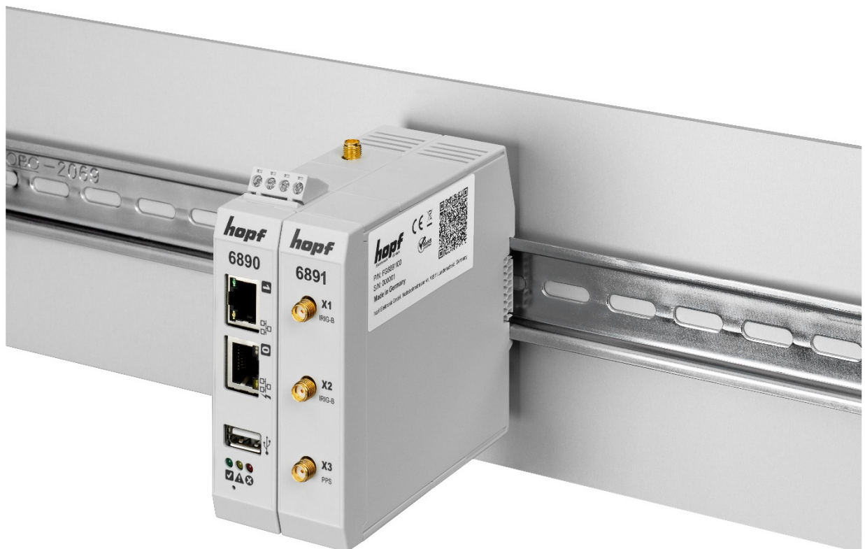
FG6890G01 with extension module FG6891I01 mounted on DIN rail